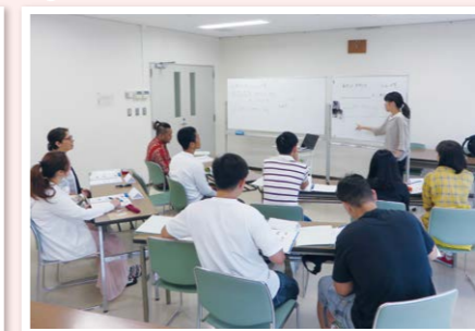
Japanese language class