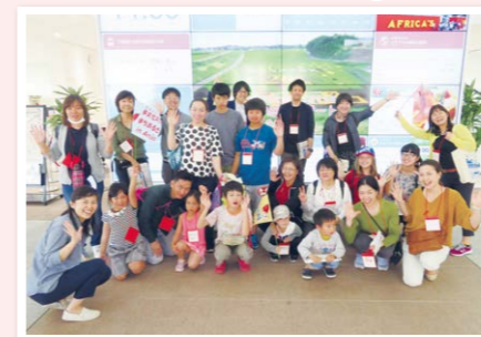
Multicultural symbiosis town-walking

Foreign and Japanese residents are working together